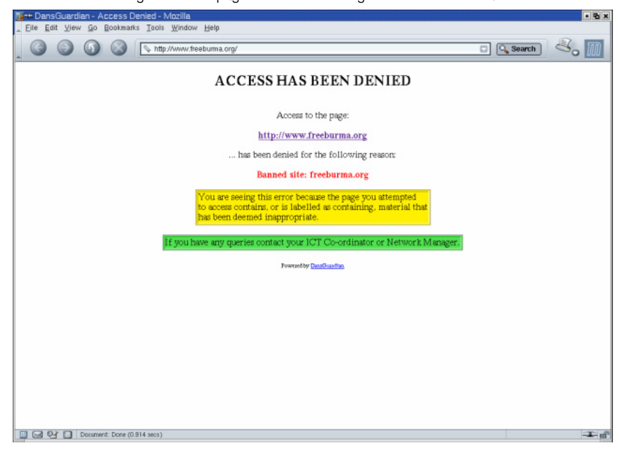
Figure 2. Blockpage found while surfing the Internet in Burma

The MPT has also asked ICT companies to submit letters pledging to avoid involvement in political matters and to control their employees' Internet usage. Some companies have not signed on yet.<sup>22</sup>